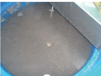
3. After 5 minutes paint particles will separate from the water and can be emptied into filter basket. The water can then be re-used and waste is reduced!