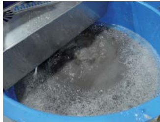
2. Agitate for 5-7 minutes