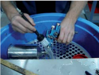
Cleaning with pre-wash brush