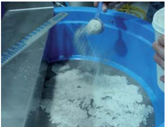
1. Add powder to soiled water