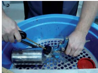
Rinse using the flush gun